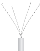
Foreign Body Retriever 4-prong grasper with hooks